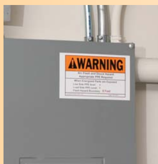
Arc Flash Warnings