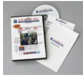
Lockout Pro™ Graphical Procedure Software