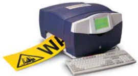
PowerMark™ Sign and Label Maker