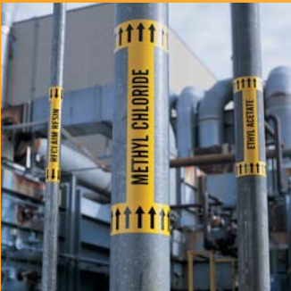
Outdoor Pipe Marking

Maintenance...Operations...Facilities ID...Predictive Maintenance...Ele