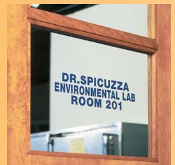
Cut Characters & Shapes