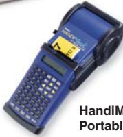
HandiMark® Portable Label Maker