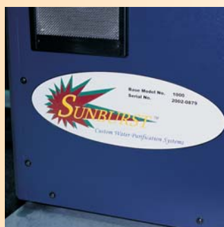
OEM Labels/Rating Plates