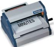
BLS 1200 Laminator