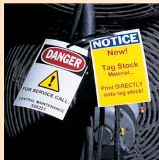
Print Directly to Tag Stock