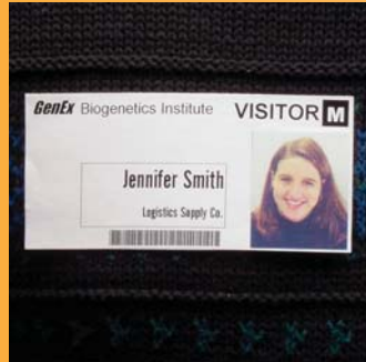
Color-Coded I.D. Badges