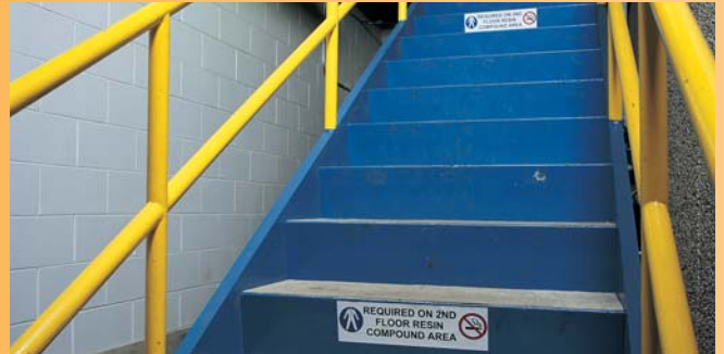
Place Your Message Where You Need It

Maintenance...Operations...Facilities ID...Predictive Maintenance...Ele