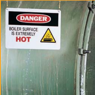
Multicolor Signs & Labels