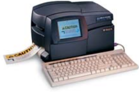
GlobalMark™ Sign and Label Maker