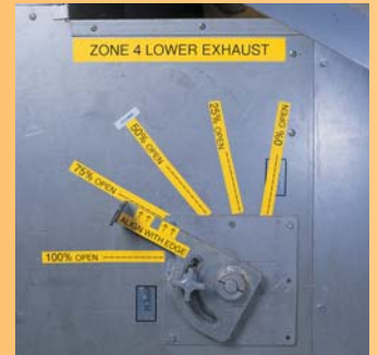
Air Duct I.D.