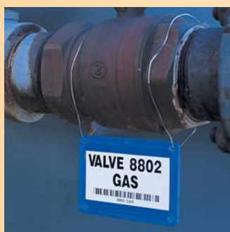
Color-Coded Valve Tags