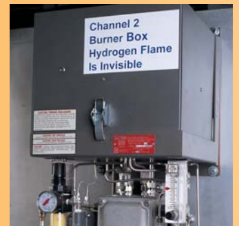
Instrumentation & Electronics

Logistics...Building & Grounds...Warehouse...Traffic Control