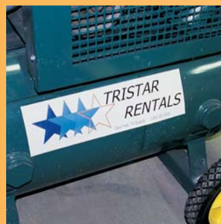
Blended Color Printing