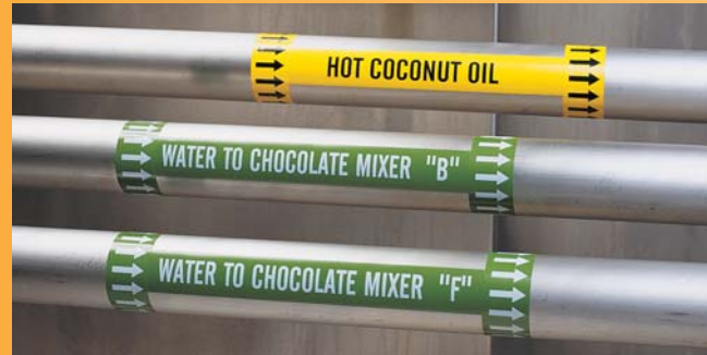
Polyester Pipemarkers for Stainless Steel Surfaces