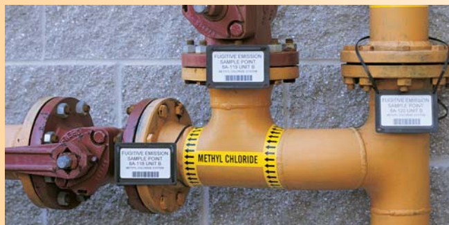
Tags for Fugitive Emission Test Points