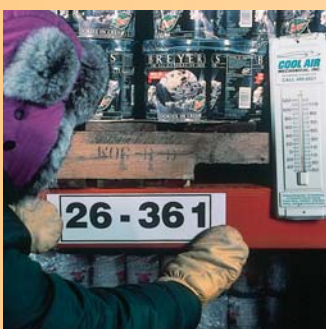
Cold Temperature Material