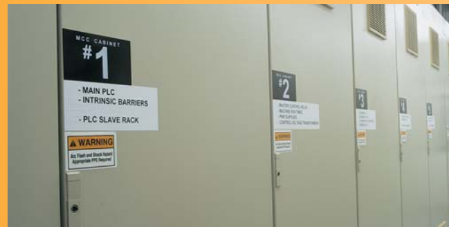
Motor Control Center