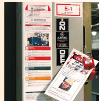
Lockout Procedures, Labels & Tags