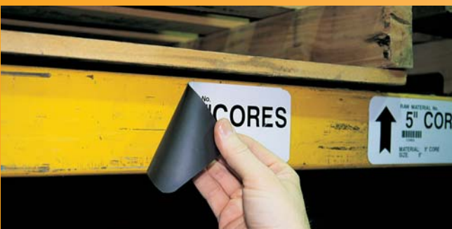
Print Directly to Magnetic Material

Logistics...Building & Grounds...Warehouse...Traffic Control